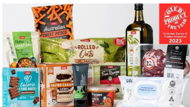
Coles Own Brand products received more than 100 product awards during the year including 11 of the consumer voted Product of the Year awards.