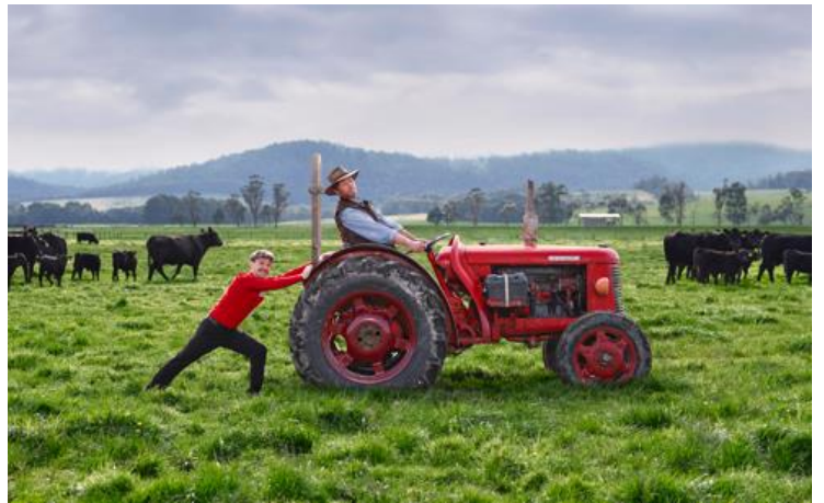
Coles' latest national campaign showcases the great lengths our team members, farmers and suppliers go through to source and deliver the highest quality products for our customers.