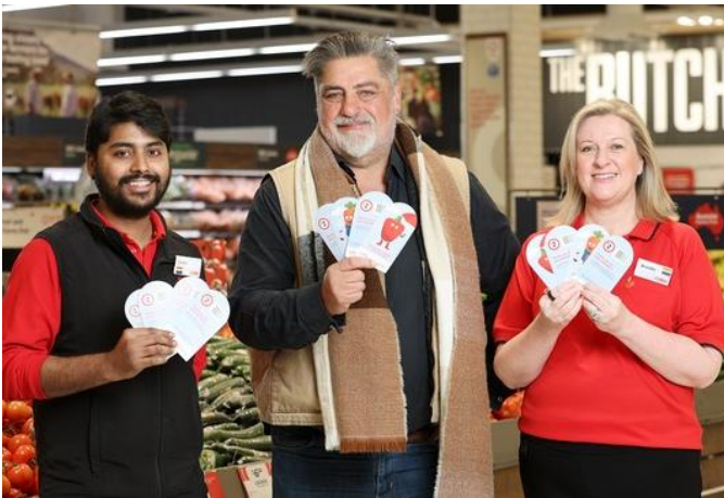
Coles supported the 2023 SecondBite Winter Appeal through the purchase of $2 donation cards or by customers making a donation of their choice in store.