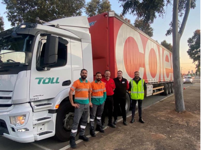
Coles delivers essential groceries to the Shepparton Showgrounds flood relief centre.

Lisa Zimmet Mobile: +61 428 857 242 E-mail: <u>investor.relations@colesgroup.com.au</u>